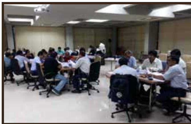
Small Group Session (during face to face offering) [Break out rooms will facilitate a similar experience in online mode]