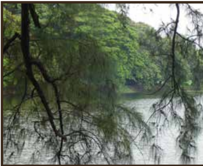
Nature's blessings for IIMC campus