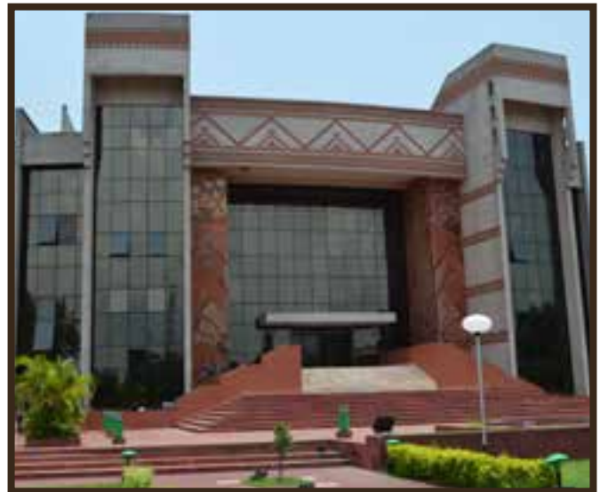
IIM Calcutta Auditorium

Our correspondence address is as follows: