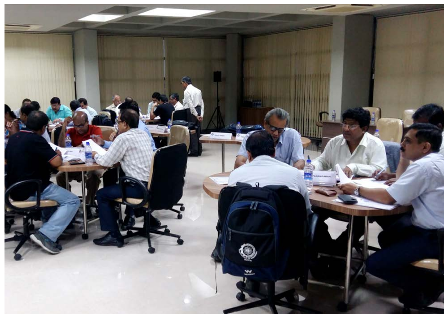
Small Group Session