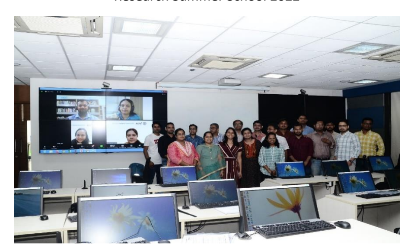
Research Summer School 2022