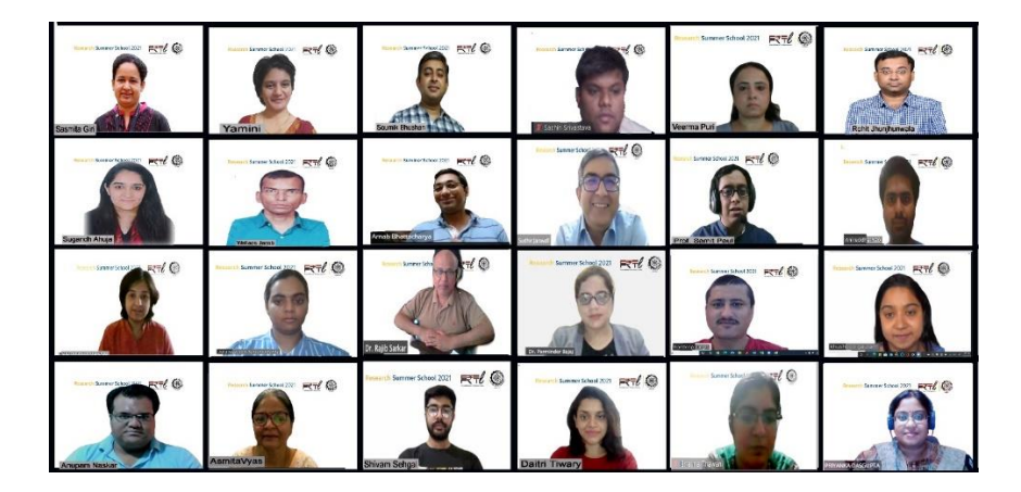
Research Summer School 2021