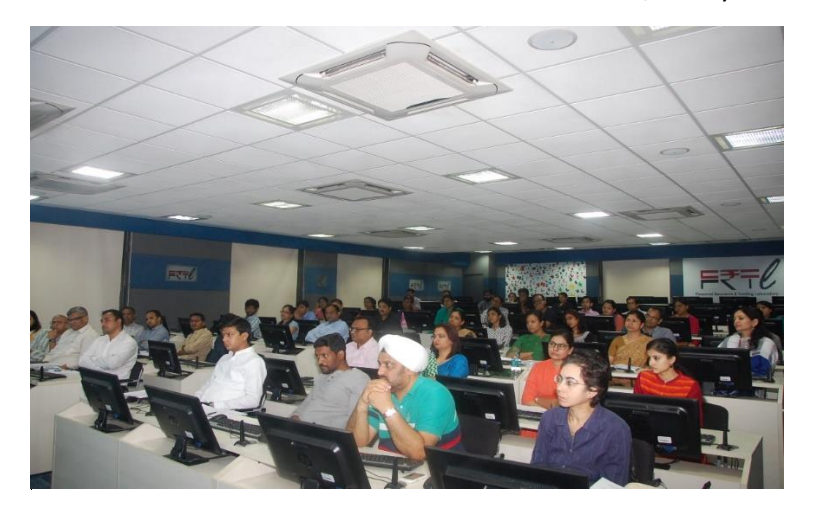
Research Summer School 2017