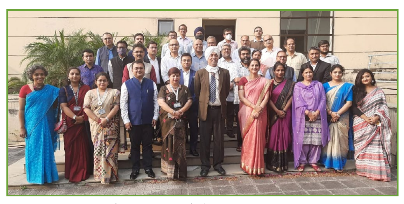
NRLM-SRLM Program Lauch for Assam, Bihar and West Bengal